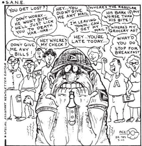
There were a lot of questions and there were a lot of answers...