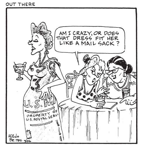
Originally published November 2009