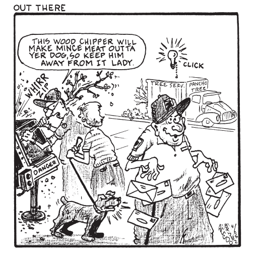
Originally published December 2009