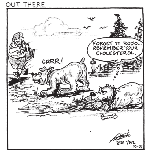
Originally published December 2009