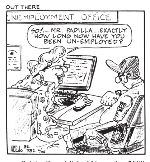
Originally published November 2009