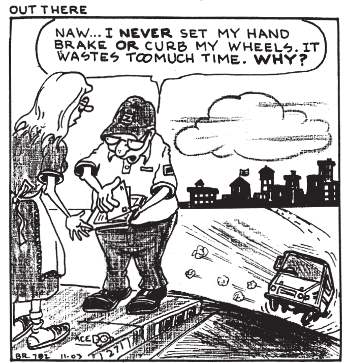
Cartoon originally published December 2003

Article courtesy of the Buffalo, New York NALC Branch 3 BUZZ published in November 2016.