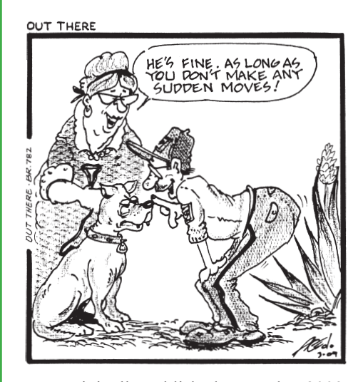
Originally published December 2009