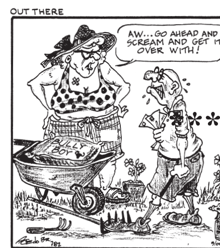
Originally published December 2009