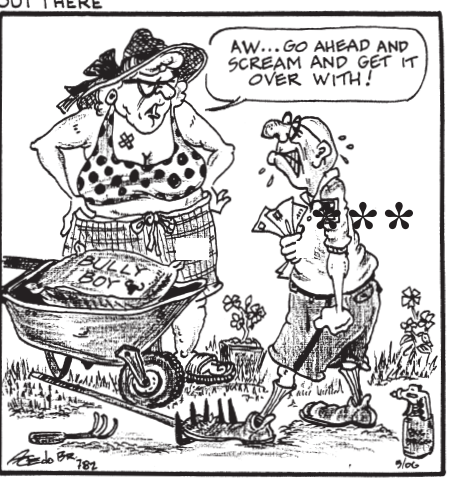
Originally published December 2009