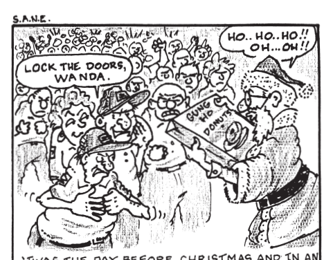
PETTY DISCIPLINES THEY HAD TO ENDURE, THE STATION MOR. DONNED A SANTA SUIT AND OFFERED FRESH DONUTS. WHEN SUDDENLY THE FESTIVE GESTURE WENT AWRY.