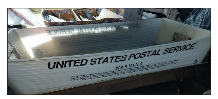
The ALPS trays will look similar to this:

I share this information because there will be an effect on letter carriers. The most immediate change will be the equipment that letter carriers use, specifically the letter trays. This is the current tray used for DPS: